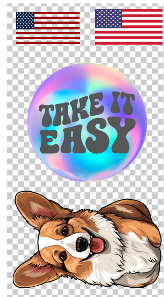
Example of one design file (gang sheet) that is 12" x 22" and includes multiple design images