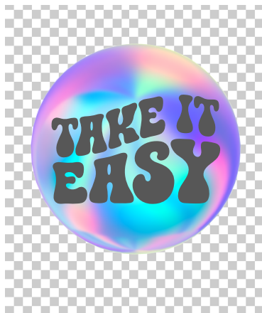
.PNG with a transparent background