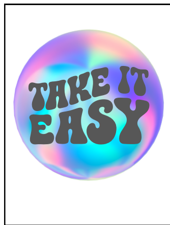
.PNG without a transparent background - good to print, but will have the white edge as shown